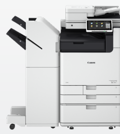
iR ADV DX 6800