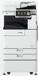
iR ADV DX 4700