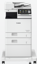
iR ADV DX 717/617/527