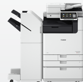
iR ADV DX C5800