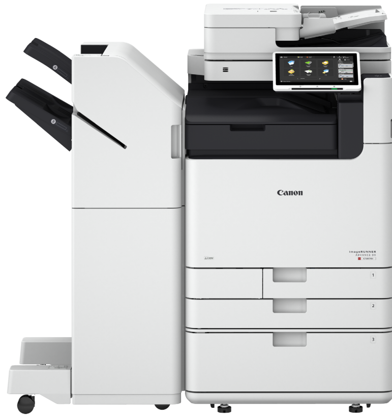
iR ADV DX C5800

The latest imageRUNNER ADVANCE C5800 Series produces up to 18% less CO2 and weighs 20% less than its predecessor.