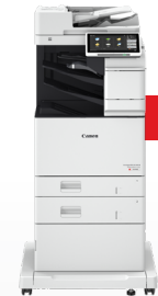
iR ADV DX C478