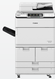
iR ADV DX 6780i