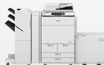
iR ADV DX C7700