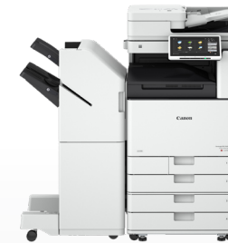
iR ADV DX C3700