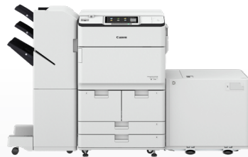
iR ADV DX 8700